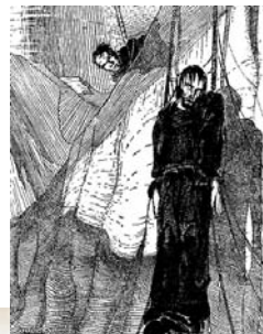
Above: Illustration from The Lighthouse on Shivering Sands